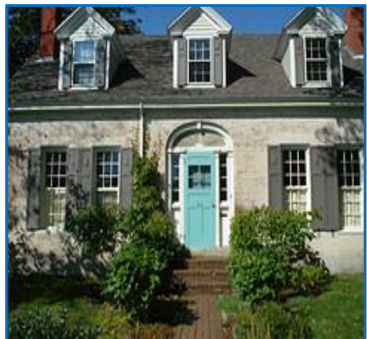
Current picture of the house

"George Kaler House c. 1829 24 High Street