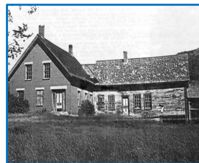
Brick house at North Stow