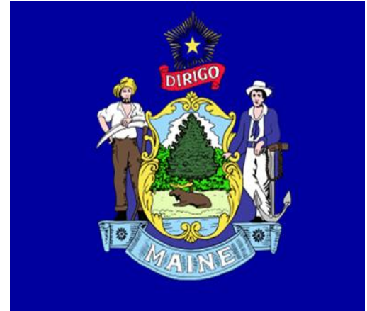
Present Day Flag