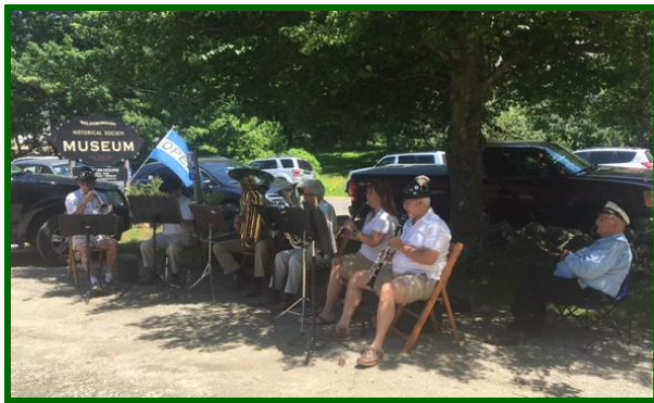
A terrific Waldoborough Historical Society 50 th Anniversary Celebration took place on Sunday, June 17, 2018! Over sixty people gathered to listen to the Kora Shrine German Band playing German musical numbers.